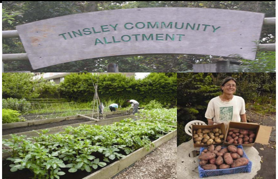
Tinsley Community Allotment is open again for weekly gardening sessions on Fridays 10am-12pm.

Tinsley Community Allotment is open again for weekly gardening sessions on Fridays 10am-12pm, they started on Friday 5 th March. This green gym has free membership and offers a variety of activities as gentle or as energetic as you like; activities range from sowing seeds and organising labels to digging beds and turning compost heaps. Learn how to grow your own fruit and vegetables using organic methods or just come and enjoy the garden and meet new people! You can enjoy the fruits of your labour as all the organic fruit and vegetables produced on the allotment are shared out amongst the volunteers. Sessions through the spring (March 5 th , 12 th , 19 th , 26 th and April 9 th , 16 th , 23 rd ) will include sowing peas, parsnips and broad beans, and planting potatoes.