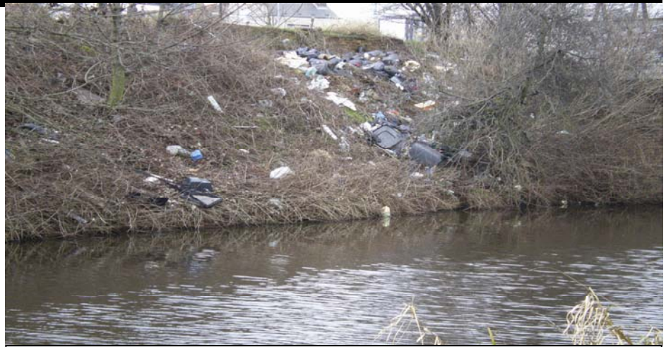
Tinsley Canal Bank March 2007

In April the canal towpath from Wharf Road to the Tram stop Bridge should be tarmaced. Tinsley Forum are in the process of developing a bid to Changing Spaces Big Lottery Fund to further improve this stretch of the towpath including benches, clearing overgrown areas that obstruct sight lines, better lighting, benches, artwork, wild flower planting, improving habitats for animals in area. (See sketch on this page) So dumping rubbish on the canal bank will spoil the pleasant experience we want for Tinsley residents when they use this towpath